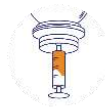
Step 3: Using a syringe, draw out the desired quantity