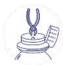
Step 2: Cut the middle part of the plug so that there is an opening for the syringe