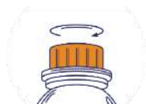
Step 1: Open the cap